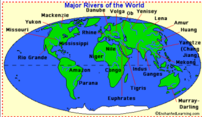
Major rivers of the world