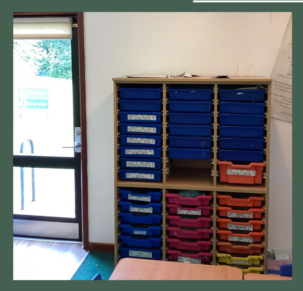
This is where your tray will be.