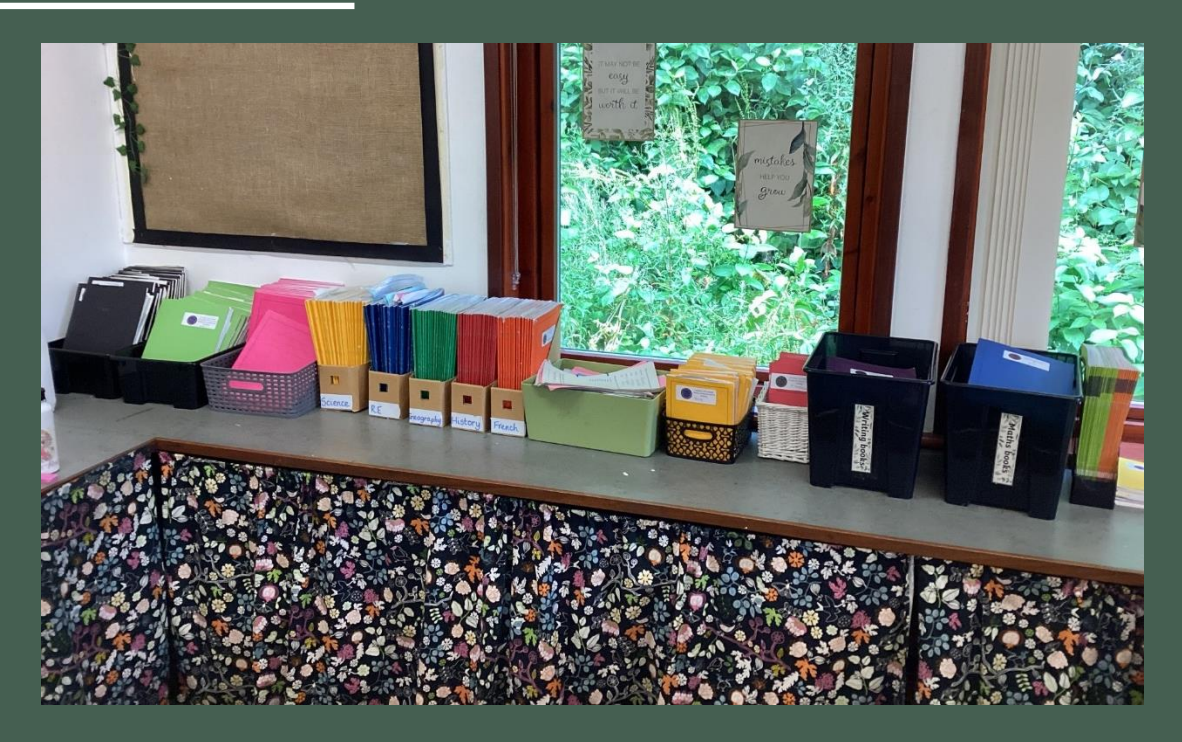
This is where we keep all of our books.